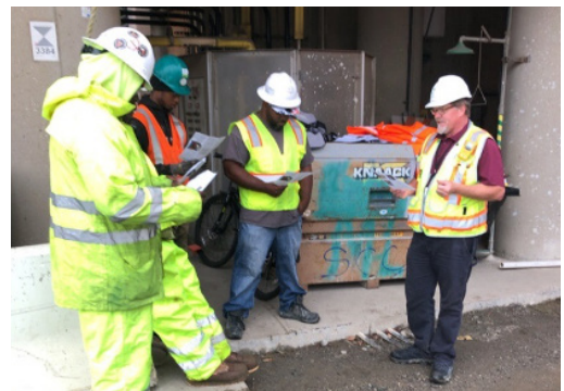
Staff receiving environmental training when they first start on an SEP project.