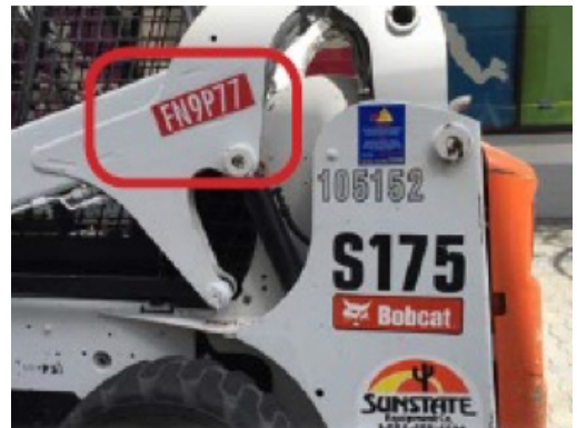
The Equipment Identification Number is issued by the CARB and allows us to verify that the specific piece of equipment is Tier 4 or equivalent.