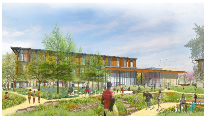
Architectural rendering of the SECC