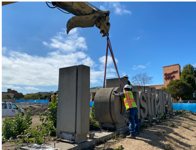
Removal of India Basin Industrial Park sign letters