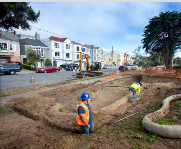
Sunset Boulevard Greenway: rain garden