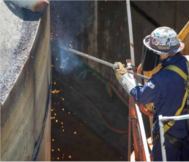
OSP Digester Gas Utilization Upgrade: gas tank demolition