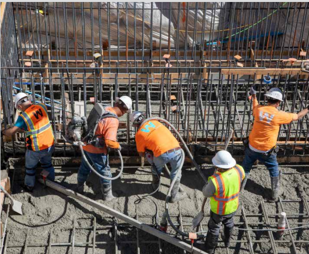
Mariposa Pump Station Improvements Project: Concrete pour for foundation of pump station