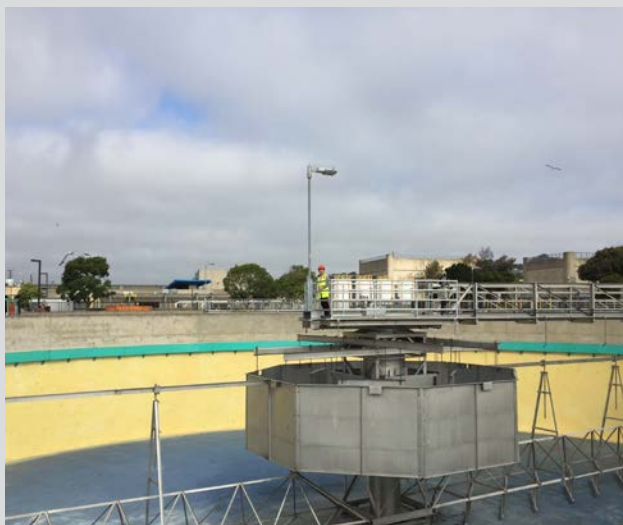
SEP Primary and Secondary Clarifier Upgrades: installation of new clarifier mechanism for clarifier #5.