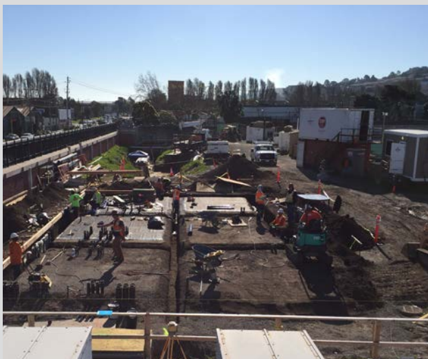
SEP 521/522 and Disinfection Upgrades Project: concrete demolition, excavation, and installation of shoring.