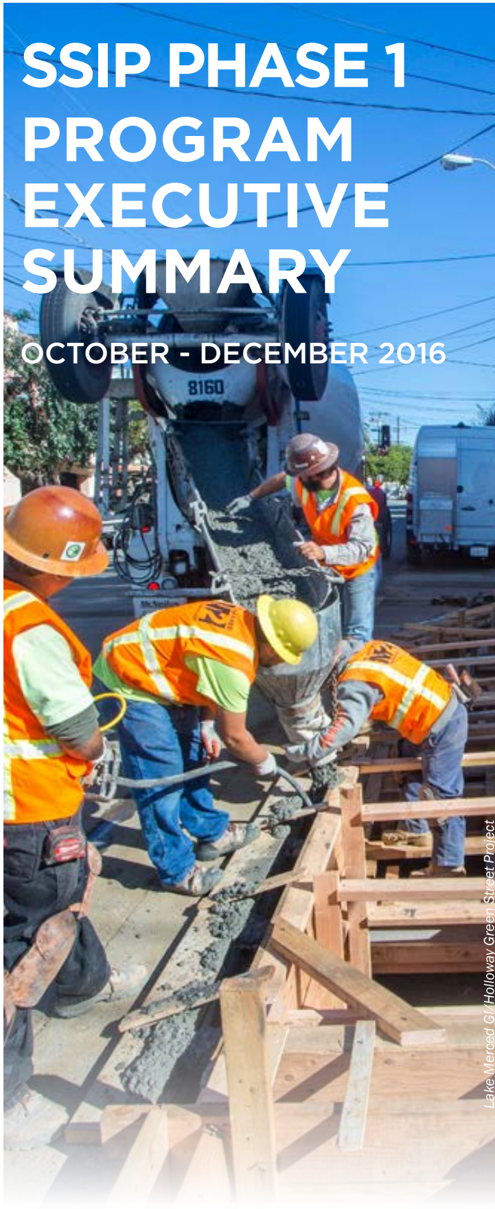
Lake Merced GI/Holloway Green Street Project